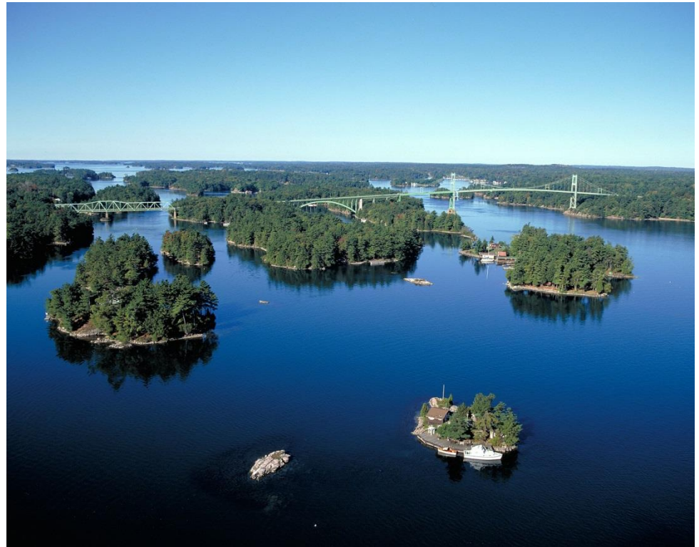
Ontario Lakes Islands