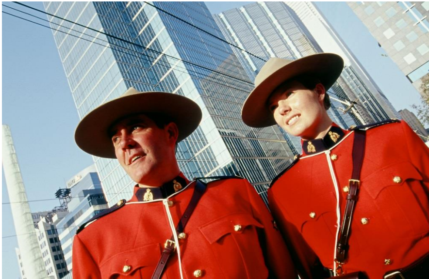
Royal Canadian Mounted Police