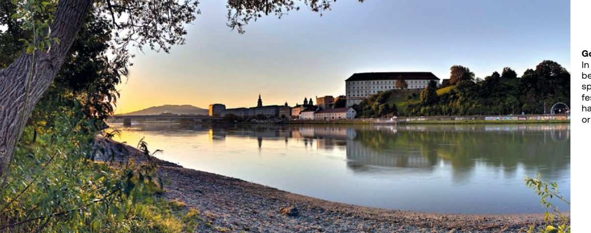
Going with the flow In Linz, everything, from beach-style bathing, and sports activities to popular festivals like Bubbledays. happens by, in, on, along, or near the Danube River.