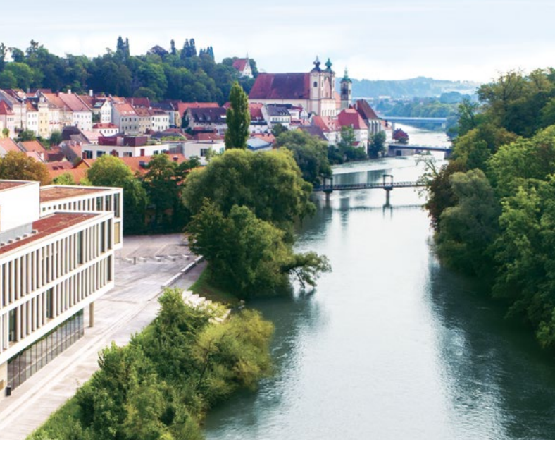
Steyr Campus – Austria's most gorgeous

As if its bold modern architecture right by the river wasn't enough of an eye-catcher. Steyr Campus' three buildings and next-generation DigiSpace boast state-of-the-art working spaces. But there is more to student life than a great campus. It's about the city. And you will fall in love with Steyr.