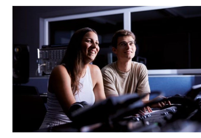
Put theory into practice in our modern, well-quipped film, audio and video editing studios.