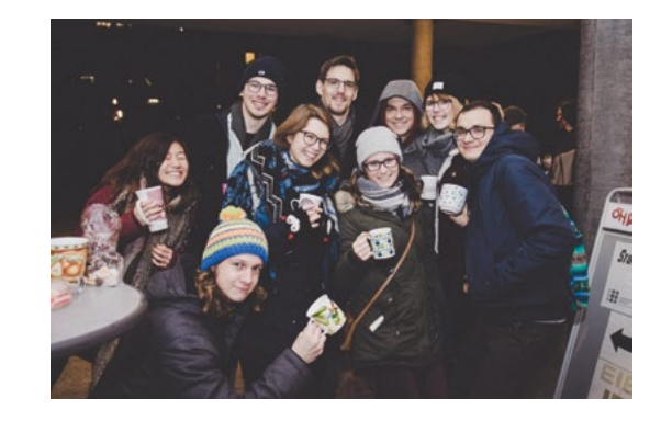
It's that festive time again at our campus winter party with Punsch and Glühwein

No wonder living on campus is a breeze with almost 600 dormitory places as well as many shared apartments and lots of private accommodation in Hagenberg. Commuting to campus is no problem thanks to links to the A7 motorway and public transport. And also within easy reach are the delights of the capital Linz, the lakes and mountains of the Salzkammergut region and cities like Vienna and Prague.