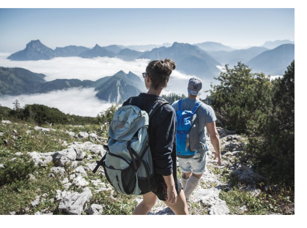
Enjoy breathtaking vistas hiking through the lush green of magical meadows and dazzling mountains. → upperaustria.com/en/activities/hiking.html