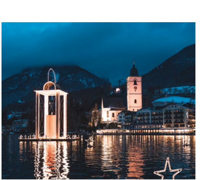
The Advent season turns Austria into a winter wonderland. Christmas fairs grace every town, and the one in St Wolfgang is one of the fairest of all.