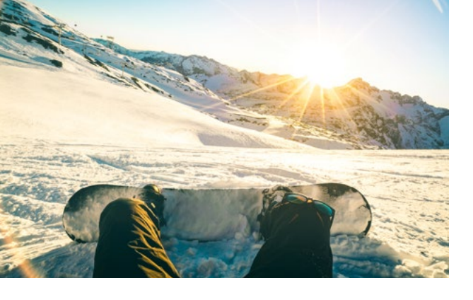
World-class slopes and great snow make Upper Austria a favorite winter sports destination. → skisport.com/HiWu/en