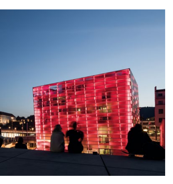
Exhibitions, events, and museum of the future: the Ars Electronica Center is Linz's most visited museum. → ars.electronica.art/news/en/

Meet the place where Europe's majestic Alps and its second-longest river, the Danube, converge to create a worldclass tourism destination. People come to hike through Upper Austria's mountains or ride along its scenic cycling routes. They dive into crystal-clear lakes, paddle away gazing at stunning alpine scenery, or hit the snow with skis or snowboards. The cities attract thriving music and art scenes and rich culture - the vibrant heritage of a once multinational empire. Food lovers appreciate the culinary diversity beyond traditional favorites like Sachertorte and Schnitzel.