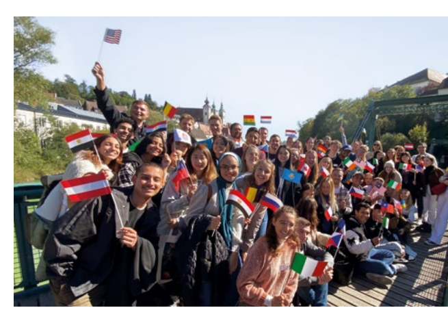
Partner universities across the world