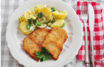
The Wiener Schnitzel is indeed the most popular dish in Austria.