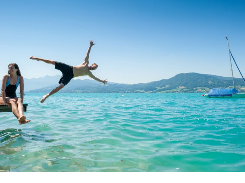
Surrounded by stunning alpine scenery, Upper Austria's crystal-clear lakes beckon to dive right in. → salzkammergut.at/en/